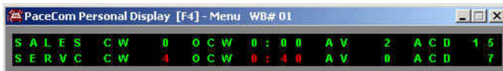
This is one of the 12 different sized PaceCom Personal Display™ screens available. Data is color-coded. The bottom line is used for moving announcement messages and data items.